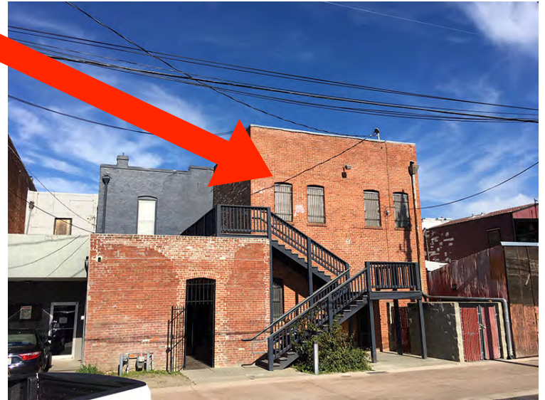
Office Located on Second Floor